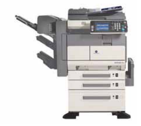
The essentials of imaging

bizhub 350/250/200 series proudly joins the bizhub family – named 2005 Product Line of the Year by Buyers Laboratory Inc.